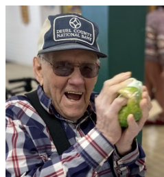
Easter Egg Coloring with Rice &