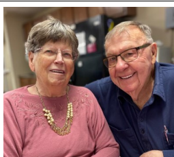
LOVE IS IN THE AIR Couple dinner, Valentines photos and cookies.